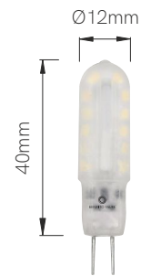
G4 Long Uniform-line