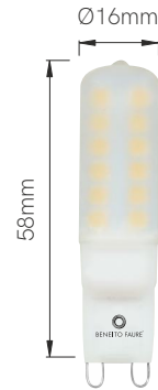
G9 Long Uniform-line